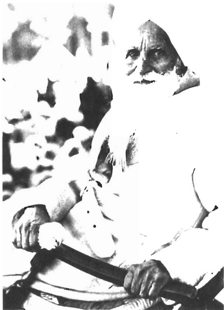
Baba Sawan Singh Ji (1858-1948)